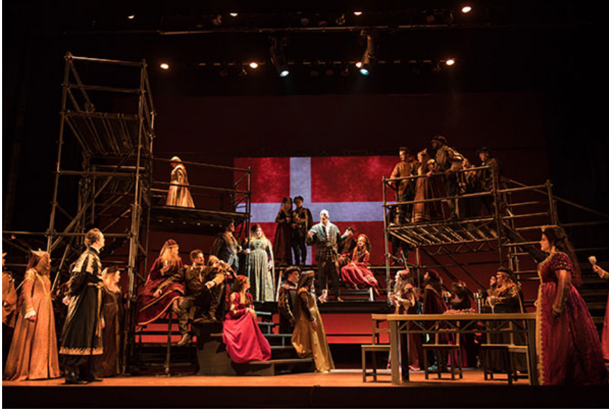
The Cast and Set for Amleto