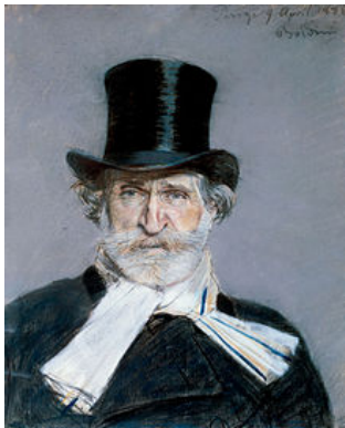
Giuseppi Verdi Portrait: Giovanni Boldini, 1886