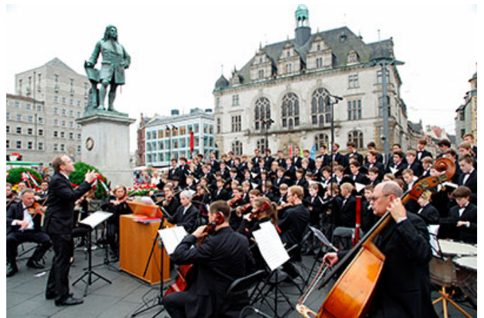
A concert in Market Square, in front of Halle's famous statue of Handel, marks the opening of the Festival

The Festival's current focus seems also to be on Handel's various pasticcios , operas that he put together borrowing from both himself and other composers. Last year at the Goethe Theatre, the visiting Lautten Compagney Berlin offered Giove in Argo ; this year they returned with Didone Abbandonato , a scintillating performance of Handel's 1837 pasticcio that included music by numerous composers, mostly Leonardo Vinci, as well as a few popular arias by Giacomelli, Vivaldi and